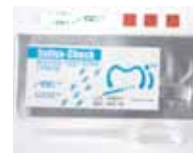
5. Buffering capacity

Step 1 and 2 – flow rate, viscosity and consistency of unstimulated saliva, provide information about how the patient's lifestyle may be consequently affecting oral health.