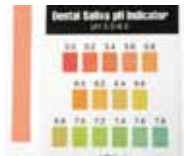
3. Salivary pH