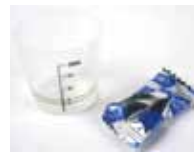
4. Saliva Flow